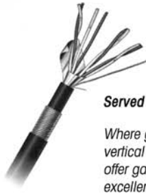
Served Wire Armor

Dekoron can provide mechanical strength and protection with several armor types available. For good cut-through and crush resistance Dekoron can offer galvanized steel and aluminum interlocked armor. Interlock armor cable is ideal for open tray installations.