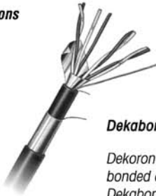
Dekabon Armor Cable

Dekoron also has the capability to apply bonded aluminum sheathing, Dekabon. Dekabon is hermetically sealed aluminum tape, bonded to a jacket that is capable of protecting the cable from moisture and chemicals. Paired with a drain wire, Dekabon acts as an electrostatic shield providing excellent lightning protection.